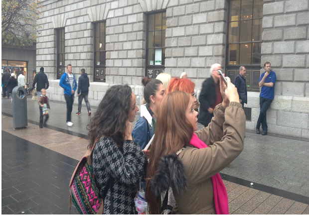
Fig. 1a. Test of GPS-based AR