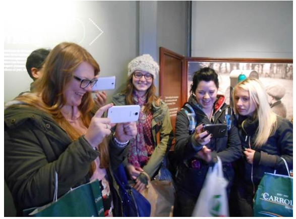
Fig. 1b. Test of marker-based AR